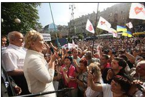
Ms. Tymoshenko speaking at protest

There are many in Ukraine's Parliament that are opposed to these reforms. The Batkivshchyna Party of Yuliya Tymoshenko has called for a protest/demonstration. Their stance is that