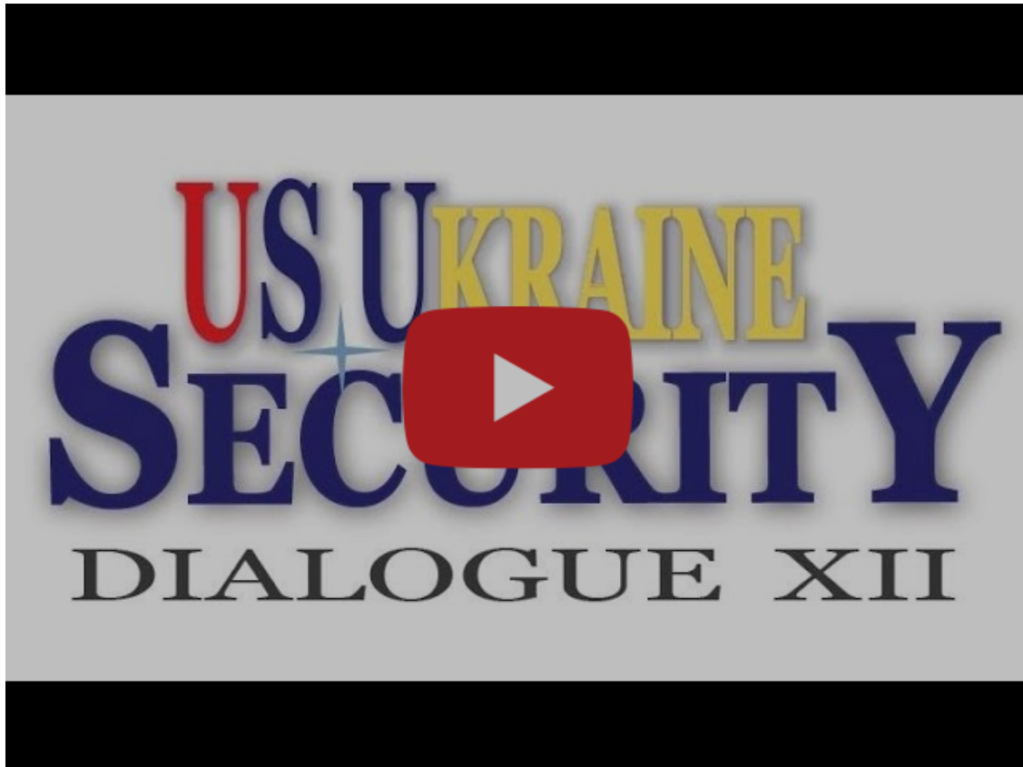
US-Ukraine Security Dialogue 2021 - Day 1 Livestream #USUASD2021

On Wednesday-Thursday, March 3-4, 2021, the twelfth US-Ukraine Security Dialogue was held via zoom to discuss " The New Administration's Approach to Ukraine's Most Pressing Security Issues. " Over the two-day event, three members of Congress addressed the participants – Senator Ben Cardin (D-MD); Congressman Andy Levin (D-MI) and Congressman Andy Harris (R-MD) – and they all underscored that there is strong bipartisan support for Ukraine in Congress, and that Ukraine's security still matters to the United States.