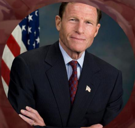
SENATOR RICHARD BLUMENTHAL (D-CT)

TUESDAY, FEBRUARY 21, 2023, 7 PM. ZOOM LINK IN OUR BIO