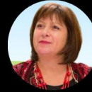
Minister Natalie Jaresko