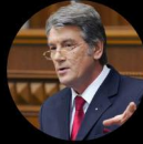
President Viktor Yushchenko

St. Andrew Ukrainian Orthodox Cathedral 300 E. Army Trail Rd., Bloomingdale, IL