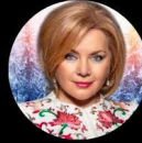
Minister Oksana Bilozir