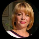
First Lady Kateryna Yushchenko