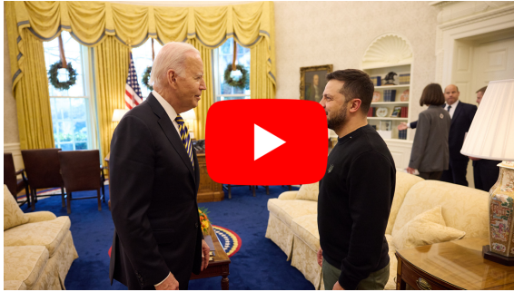
President Biden with President Zelenskyy

To cap off the visit, President Zelenskyy met with President Joe Biden at the White House on Tuesday afternoon. Both leaders discussed plans for the coming year, the growing cooperation between U.S. and Ukrainian defense industries, and Ukraine's use of the corridor in the Black Sea to export its grain and other products. President Zelenskyy also emphasized that even during the war, Ukraine continues to successfully reform its institutions to integrate into the European Union.