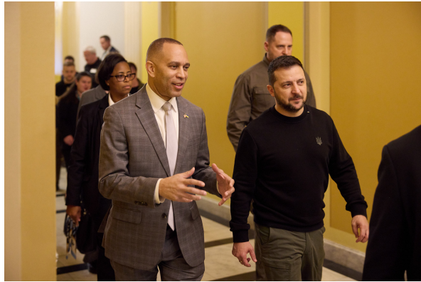
Dem Caucus Leader Hakeem Jeffries