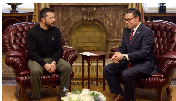
Speaker Johnson with President Zelenskyy

Following a their 30-minute meeting, Speaker Johnson said that the Biden administration’s response to congressional Republicans’ demands has been “insufficient,” and reiterated his stance that a deal remains unlikely without a “transformative change” at the border.