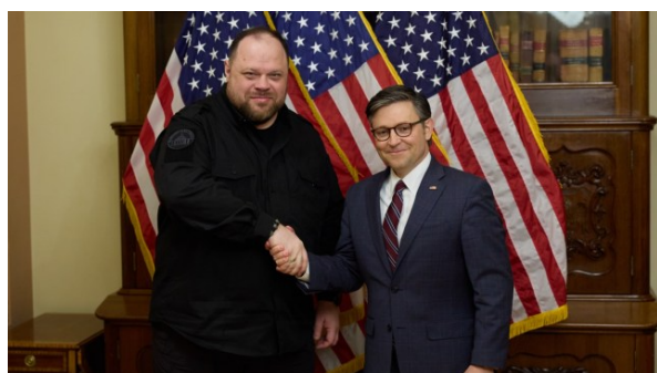
Speaker Johnson with Speaker Stefanchuk

Exactly one week earlier, recently elected House Speaker Mike Johnson (R-LA) had hosted his counterpart Ruslan Stefanchuk , Speaker of the Verkhovna Rada (Parliament) of Ukraine. President Zelenskyy followed up on the topics discussed in that earlier meeting by first expressing gratitude to the U.S. Congress for all of their efforts to date in “providing our country with significant assistance that allows us to effectively counter the aggressor.” President Zelenskyy also complimented the reproduction of the Ukrainian Ostroh Bible (c.1580) on display in the Speaker's office.