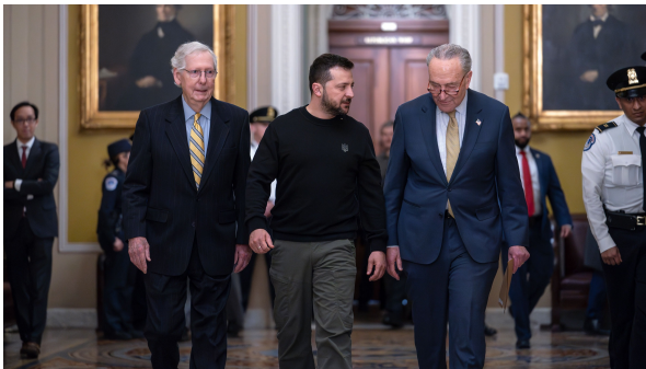
With Sens. McConnell and Schumer

Additional meetings on 11 December included visiting with the leadership of the International Monetary Fund and the World Bank respectively, as well as hosting executives from major U.S. defense companies . As with his September visit, President Zelenskyy dedicated his time on 12 December to meeting with as many elected officials as time would allow.