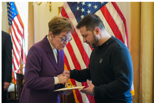
CUC Co-Chair Marcy Kaptur