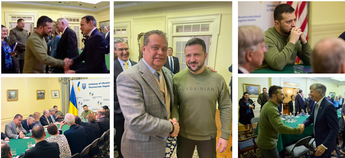
UCCA Greets President Zelenskyy