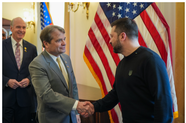
CUC Co-Chair Mike Quigley

President Zelenskyy also met with U.S. Vice President Kamala Harris on 12 December. The leaders agreed on the importance of continued international support to sustain the morale of the Ukrainian people, who must know that they are not alone as they defend their country against Russian aggression.