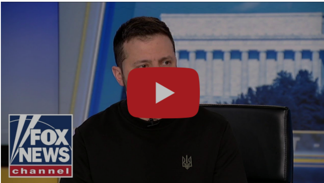
President Zelenskyy to Fox News: "We only have one enemy and it's Putin"

Following the meeting, both leaders held a joint press conference at the Eisenhower Executive Office Building. At that press conference, President Biden announced that he had authorized an additional $200 million in drawdown funds for Ukraine.