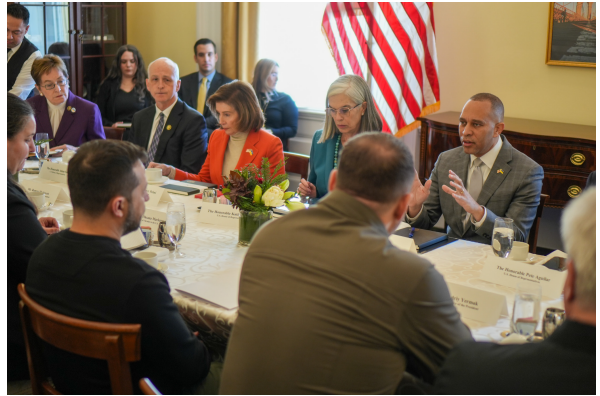
Dem Caucus Meeting