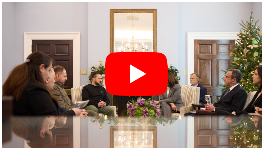
Vice President Harris with President Zelenskyy

President Zelenskyy also met with U.S. Vice President Kamala Harris on 12 December. The leaders agreed on the importance of continued international support to sustain the morale of the Ukrainian people, who must know that they are not alone as they defend their country against Russian aggression.