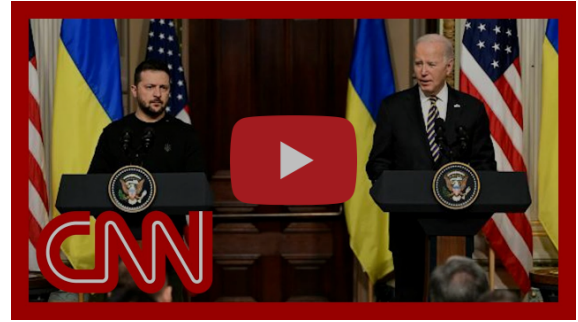
Joint Press Conference

Following the meeting, both leaders held a joint press conference at the Eisenhower Executive Office Building. At that press conference, President Biden announced that he had authorized an additional $200 million in drawdown funds for Ukraine.