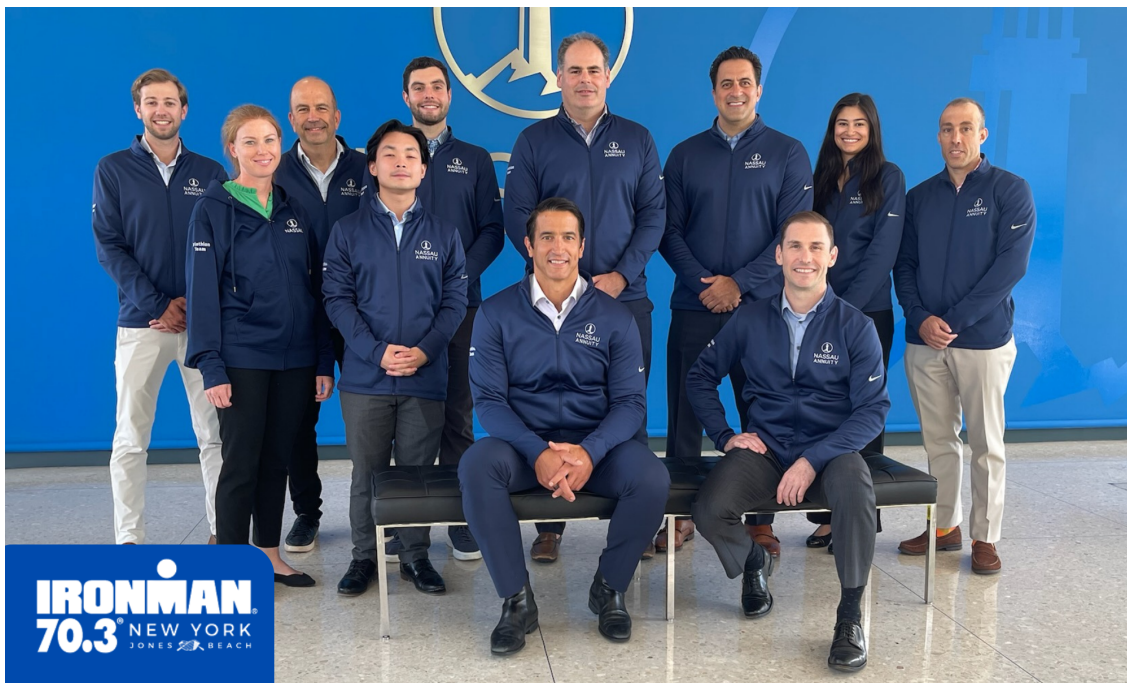
Nassau Annuity Triathlon Team