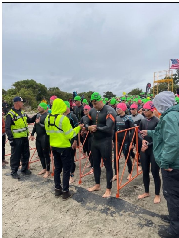
Lining up for the swim

The Nassau Annuity Triathlon Team has participated in four triathlons together, and the IRONMAN 70.3 at Jones Beach was definitely our toughest. We wanted to enhance our participation by adding a fundraising component, and we got a great response from our employees, business partners, and personal networks in support of our team and UCCA.