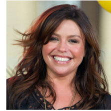
RACHAEL RAY TV Personality and cook