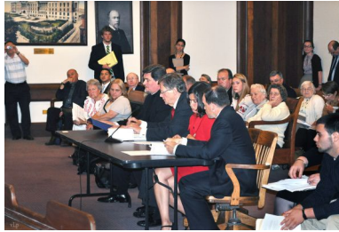
Panelists testifying before Massachusetts Joint Committee on Education

On June 14 th , the Joint Committee on Education of the State of Massachusetts held a public hearing to discuss the curriculum. Taking advantage of this opportunity, the Massachusetts Holodomor Committee and the UCCA Boston Branch organized a panel of presenters in support of bills H. 1076 and S. 234 which would require the instruction of the Ukrainian Genocide of 1932-1933 in the public schools of the Commonwealth. .