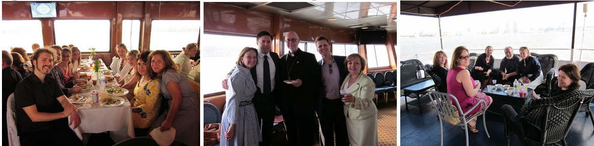
Photos from 70 th Anniversary of UCCA Cruise hosted by the NYC Branch

To mark the 70 th anniversary of the UCCA, the NYC Branch hosted a celebratory event on May 21 st aboard The Jewel , a 120 foot chartered yacht. After the 70 th anniversary program which included speakers and a slide presentation of the UCCA's history, over 100 guests enjoyed a buffet luncheon, music, dancing and spectacular views of Manhattan from the boat's canopied deck.