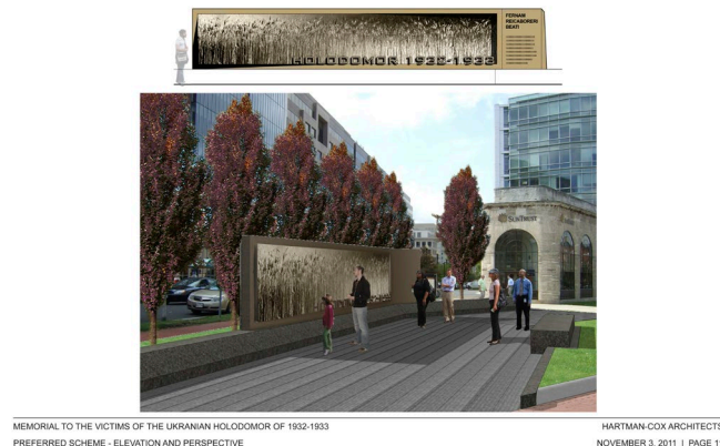
The Holodomor Memorial Design

The latter months of 2011 also saw the future of the Ukrainian Famine-Genocide Memorial become more apparent. After months of bureaucracy, progress was finally made in selecting a featured design for the future memorial in Washington, DC. This issue has always been of particular importance to the Ukrainian National Information Service in monitoring its evolution from a bill in Congress, to a signed law by President Bush in 2006, and now on a path to becoming reality. In its infant stages, the project will require more government hearings and regulatory overview, though it is expected to be completed during the commemoration of the 80 th anniversary of the Ukrainian Famine-Genocide ( Holodomor ).