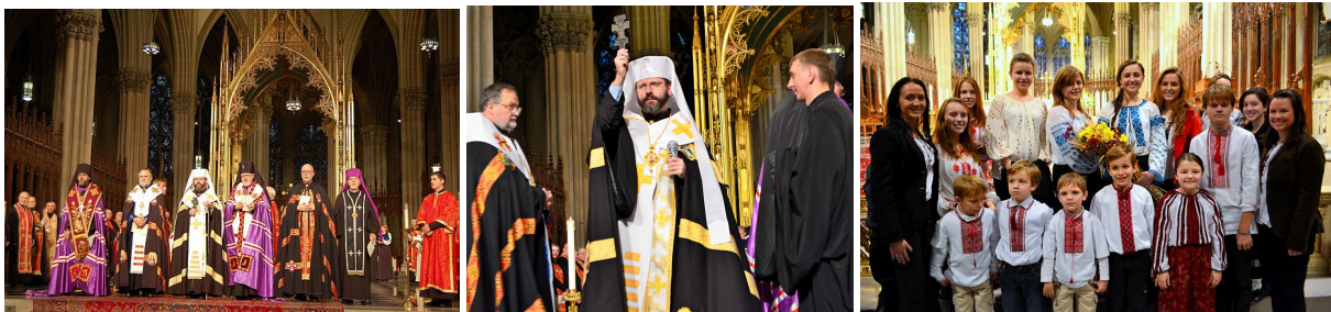
His Beatitude Sviatoslav and Religious hierarchy at St. Patrick's; Members of the Ukrainian Youth Organization CYM