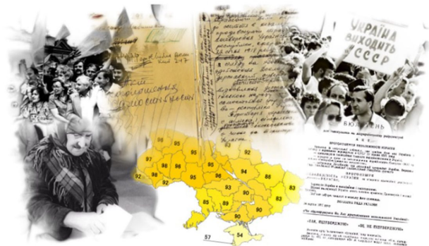
1 грудня – 30-а річниця Всеукраїнського референдуму на підтвердження Акту проголошення Незалежності України (1991)

On this 30 th anniversary of the All-Ukrainian Referendum, the Ukrainian Congress Committee of America (UCCA), sends its warmest greetings to the people of Ukraine. December 1 st has gone down in infamy as the turning point in the establishment of the modern Ukrainian state, when thirty years ago, the Ukrainian nation overwhelmingly voted for Ukraine's independence. Unfortunately, today, Ukrainians continue (for 7 years) to defend their hard-won freedom against the aggressions of its northern neighbor Russia. UCCA marks this historic December 1 st Referendum with reverence and continues to salute Ukraine's freedom fighters who are defending Ukraine's territorial integrity and sovereignty.