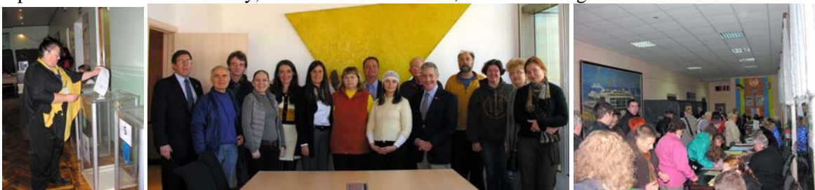
L to R: Election Commissioner dropping the protocol into the urn; UCCA Observers; Voters in Odesa

The UCCA would like to extend our congratulations to the newly elected mayors and municipal councils across Ukraine, and wishes them strength in normalizing and stabilizing the situation in Ukraine for the furtherance of democracy. The UCCA stands together with the Ukrainian people in their desire for real reforms, including first and foremost an end to endemic corruption, which will ensure the further development of Ukraine's economy, democratic institutions, and Euro-integration."