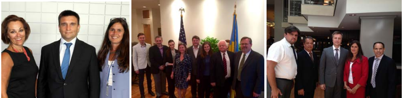
L to R: Ukraine’s Foreign Minister Pavlo Klimkin (center); Ukraine’s Minister of Youth and Sport, Ihor Zhdanov (center); former Head of the Security Service of Ukraine, Valentyn Nalaivaychenko;

Throughout the year, the UCCA organized an unprecedented amount of HIGH-LEVEL EXCHANGES with top Ukrainian political and NGO leaders, ranging from Ministers, to Members of Parliament as well as non-government organizations, and community leaders.