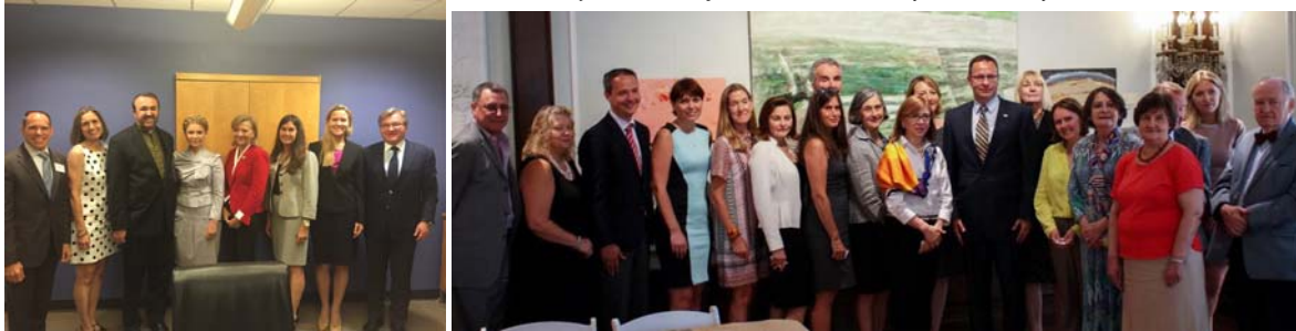
L to R: former Prime Minister Yulia Tymoshenko; H.E. Zygimantis Pavilionis, Lithuania’s ambassador to the U.S

During his first visit to the United States for the opening of the 70 th UN General Assembly, UCCA hosted a community event for His Excellency Petro Poroshenko, PRESIDENT OF UKRAINE , and Maryna Poroshenko, the First Lady of Ukraine. The President thanked the Ukrainian American community for its contribution to the development of the Ukrainian army, noting "We are fighting for the freedom of the world, democracy in the world. That's why we will win." The President remarked that it would be a "good tradition" to begin every foreign visit with a meeting with the Diaspora, stating, "They are true heroes who made a significant contribution to Ukraine's struggle for freedom and are now making a vital contribution to the reformation of the country." The President noted that the Diaspora contributes greatly to the international support for Ukraine, and "such support is the key to our victory."