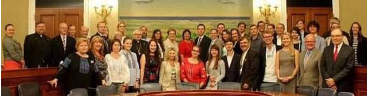
During [month] Ukraine’s Finance Minister, Natalie Jaresko (center), joined dozens of “Ukrainian Days” participants.

In 2015, UCCA remained at the forefront of garnering assistance for Ukraine and ensuring that all levels of government were supporting Ukraine’s territorial integrity. The UCCA’s Washington, DC public affairs office, the Ukrainian National Information Service (UNIS), worked diligently in advocating a variety of issues and organizing a series of “Ukrainian Days” advocacy events in our nation’s capital. By meeting with members of Congress on a regular basis, UNIS was instrumental in helping to build Congressional support for Ukraine against mounting Russian aggression. Through ongoing dialogue with elected officials and leading opinion makers, UCCA/UNIS has been successful in bringing the real situation in Ukraine to the fore.