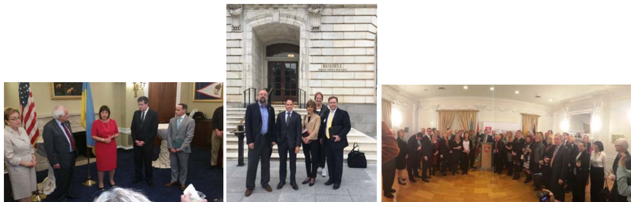
L to R: Co-chairs of the Congressional Ukrainian Caucus with Minister of Finance Natalie Jaresko at a reception for the Ukrainian Days participants; CEEC Advocacy Event – April 2015 representatives of the Ukrainian, Georgian, Latvian, Estonian, and Hungarian communities; Lithuanian Ambassador supporting Ukraine.

Throughout 2015, UNIS continued to work hand-in-hand with the CENTRAL EAST EUROPEAN COALITION (CEEC) , an alliance of U.S.-based ethnic organizations representing over 20 million such Americans, by regularly issuing Policy Papers to share concerns and ideas with the United States Congress and Administration, as well as meeting with numerous congressional leaders during two “Ukrainian Day” advocacy events and a joint UNIS/CEEC advocacy event in April 2015. A joint letter from the CEEC, the AJC, and the UCCA was sent to President Obama in early 2015 to apprise the President of the communities’ concern about Russian aggression in the region, in particular the invasion of Ukraine. Together with other Washington-based organizations, additional letters of support for Ukraine were sent to prominent congressional committees during the appropriations process. Ukraine was fortunate to attain higher levels of assistance in fiscal year 2016.